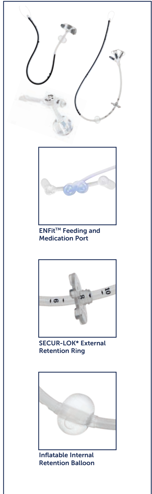
ENFit™ Feeding and Medication Port

Helping your patients face the use of a gastrostomy tube, possibly for a lifetime, can be a challenge. Halyard's variety of quality feeding tubes and accessories helps you make the right choice for your patient. By selecting MIC*/MIC-KEY* Enterostomy Tubes, you may be assured that you have chosen innovative products that consistently perform and are well recognised and accepted among healthcare professionals.